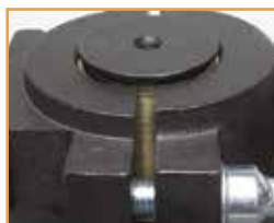
breakaway hub prevents gearbox damage