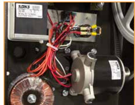
dc motor and battery backup for continued gate operation if AC power is lost