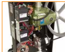
steel frame for strength and durability