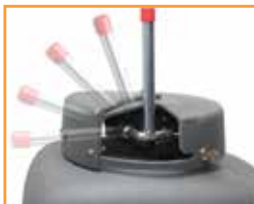
simple manual release